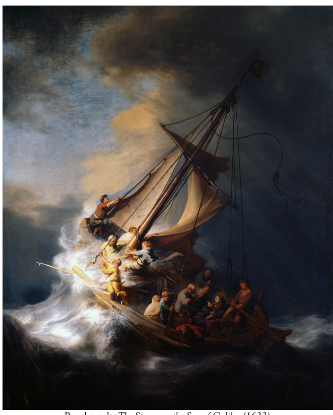
Rembrandt, The Storm on the Sea of Galilee (1633)